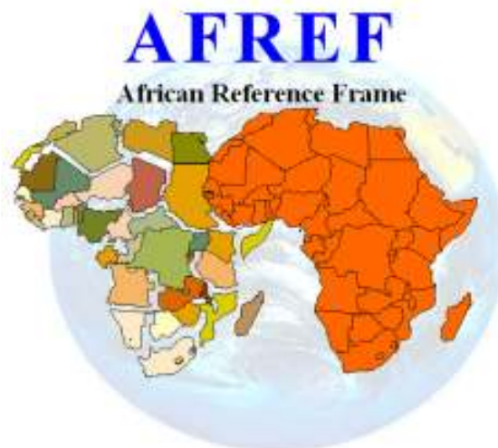
Figure 2: AFREF logo launched at the technical workshop held in July 2006

Although the ideals and concepts of AFREF have been debated for a number of years, the scientific and technical aspects of the project had never been highlighted in a dedicated workshop. The possibility of South Africa hosting such a technical workshop was raised at a United Nations Office for Outer Space Affairs (UNOOSA) meeting in Vienna in December 2004. A small Local Organising Committee was constituted and the University of Cape Town was selected as the most appropriate venue. The workshop was initially planned for January / February 2006 but, because of insufficient funding at the time, was postponed to July 2006. The University of Cape Town and the Chief Directorate: Surveying and Mapping jointly organised the first AFREF Technical Workshop in July 2006, relating to the establishment of the African Geodetic Reference Frame. Delegates from 24 countries attended. 38 representatives from 17 countries with a good geographical distribution throughout Africa were represented at the workshop. 4 representatives from 2 of the 3 regional centres for mapping in Africa also participated in the workshop viz. the Regional Centre for Mapping of Resources for Development (RCMRD) based in Kenya and the Regional Centre for Training in Aerospace Surveys (RECTAS) based in Nigeria. In addition to the above representatives from Africa, 15 speakers from a number of organisations outside of Africa gave presentations.